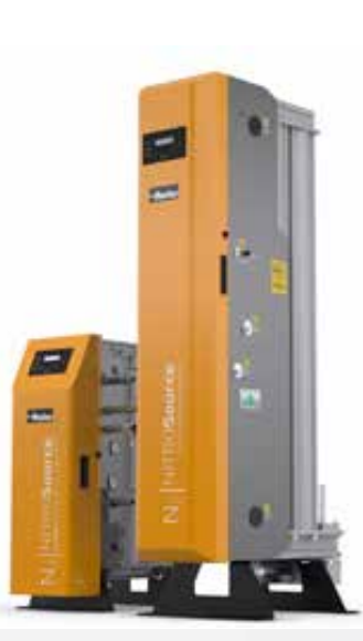
Parker NITROSource and NITROSource Compact nitrogen generators

The Parker extended warranty is available across our industrial product range* including: